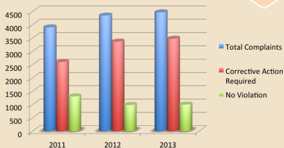
OCR Investigated Complaints